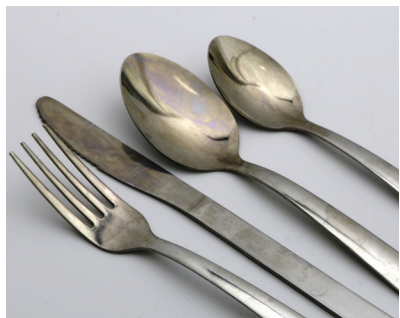
Before using SMARTPOWER™ Presoak.