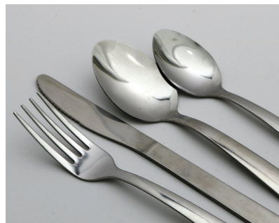
After using SMARTPOWER™ Presoak.